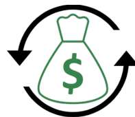
Cash Flow Issues