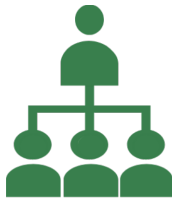
Accounting Systems Inefficiencies

Many small businesses suffer from challenges across these areas: