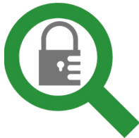
Risk of Fraud